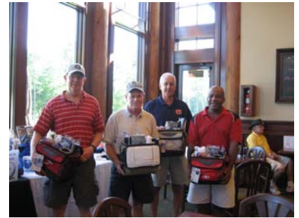
Congratulations to our 1st Place team!