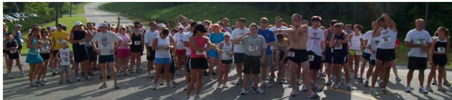
Family Connection’s 5K runners line up at the Run For Shelter